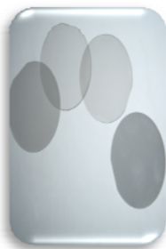
Sapphire 2& 4 Inch Wafers