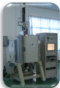
Crystal Growing Equipment